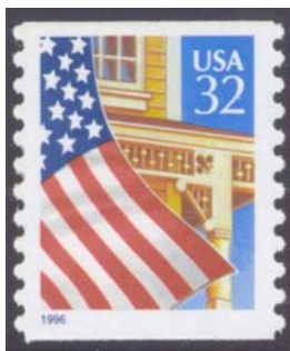
Figure 1 12/12 PV/PV

To further complicate matters, the placement of the cutter wheels, have been known to shift up or down slightly, either individually, or in some instances, two adjacent wheels would