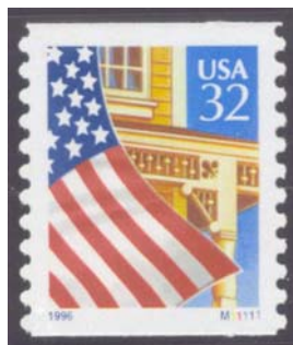
Figure 2 12/12 VP/VP

shift together. When properly set, the correct configuration for all normal 3133s are in fact 12/12, PV/PV (Figure 1), or 12/12 VP/VP (Figure 2). Figure one is also an example of a pair of cutter wheels shifting together. The large margin on the bottom corresponds with the smaller