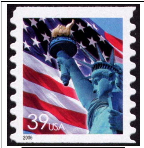
Bell Top Right

It's possible to find Bell die cuts on the 39c Lady Liberty and Flag (2006-9), but the bells have moved from their former locations. In the past, if a bell was on top, it was in the upper left corner. If a bell was on the bottom, it was in the lower right corner. The illustrations below show the new locations.