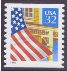
Figure 3 13/13 PP/PP