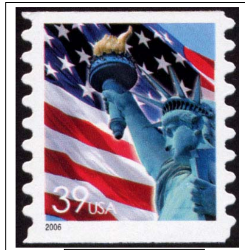
Bell Bottom Left

The movement occurred because sometime during the production of the 24c Common Buckeye coil (2006-2), a different die cutting mat was employed. Below is a Common Buckeye coil shown in vertical orientation that exhibits the bell in the upper right corner.