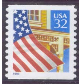
Figure 4 12/12 VV/VV

When the shift of two cutter wheels spread apart, then a slightly larger stamp (1 – 1 1/2 mm) would occur height wise, with larger than normal margins on the top, and/or the bottom of the stamps. This is what caused the appearance of a 13/13 PP/PP variety, (Figure 3), and a 12/12