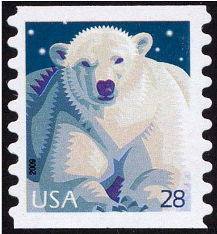
Thimble Bottom to VP Dramatic Die Cut Shift

The single 28¢ Polar Bear stamp at left has the attributes of the “Thimble Bottom” VP die cut on its left edge, and a normally aligned Valley Peak die cut on its right edge. (See the 28¢ Polar Bears on previous page to view what a normal Valley/Peak and a normal Thimble Bottom should look like.)