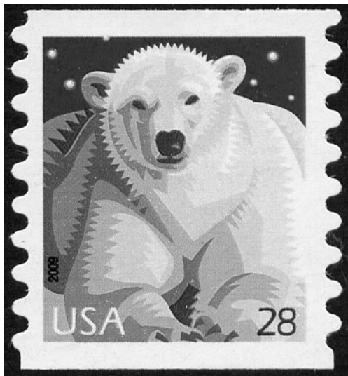
Thimble Bottom Die Cut (matching shapes on both sides)

This is the third in a series of articles on the Dramatic Die Cut Shifts found on the 44¢ Star Flag (2009-7) and the 28¢ Polar Bear (2009-2), both from Avery Dennison. All rolls of either issue I have examined so far come with a dramatic die cut shift every 25 stamps along the roll. Sometimes these shifts occur within a plate strip of five (PS5) with a plate number, but most often they do not. The shift covered in this article is the shift from a Thimble Bottom shape of a Valley/Peak (VP) die cut, to a normally shaped VP die cut. Information in these articles will be incorporated into the revised Avery Dennison Die Cut Varieties publication offered in this issue of Coil Line . (See page 55 for more about the PNC 3 publications now being offered for 2010 orders. You can use the order form on the inside of this issue’s mailing wrapper.)