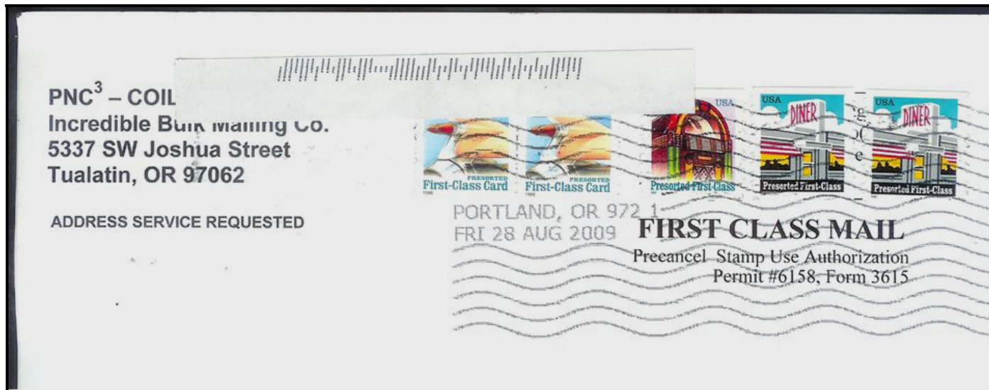
USPS 4-state barcode affixed to Coil Line along top

We've all lamented the dearth of stamp use on mail these days. Even bulk mailers are moving away from using real stamps on their items. For this reason, I have been thankful that Coil Line offers a first class mailing option. The extra expense is definitely worth it for me to get postally used stamps of all kinds.