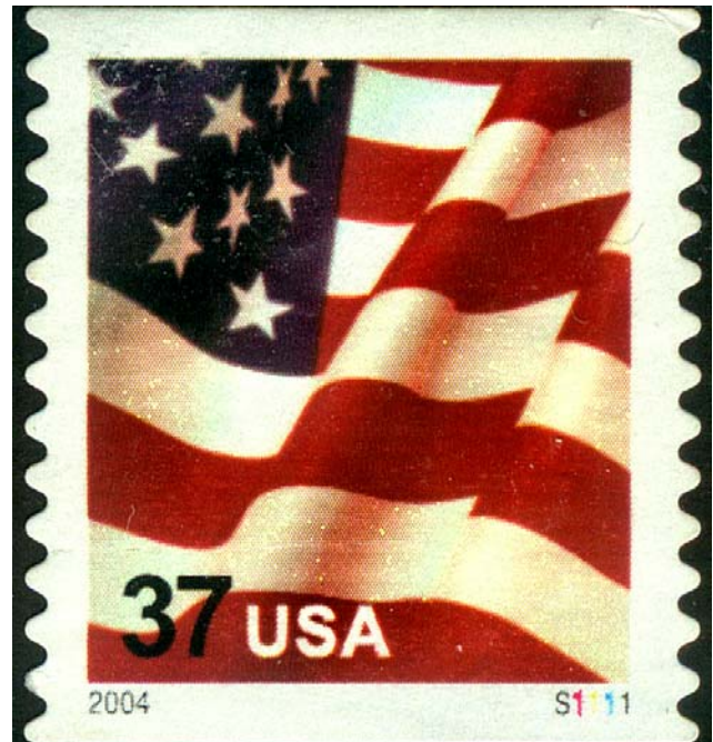
3 rd “untagged” 37¢ Flag coil, first PNC example (note: see related news on page 51)

When asked about how he came to obtain this stamp and why it wasn’t previously reported, he replied that he had obtained it on eBay “several years ago”. Because it was the sole item in the eBay auction lot and described as “untagged”, he just assumed that such an item wasn’t news.