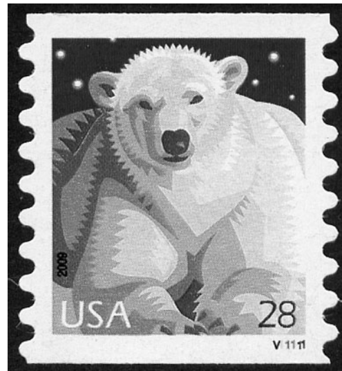
Valley/Peak Die Cut (matching shapes on both sides)

To understand the die cutting shift that occurs every 25 stamps along the Avery Dennison coils, one must know what a normal version of each variety looks like. Above at left is a “Thimble Bottom” die cut. ( This is a specialized variety of the Valley/Peak type of die cutting. ) Note the long straight cut at the bottom on both the left and right sides, giving rise to the name “thimble” for the entire bottom’s shape.