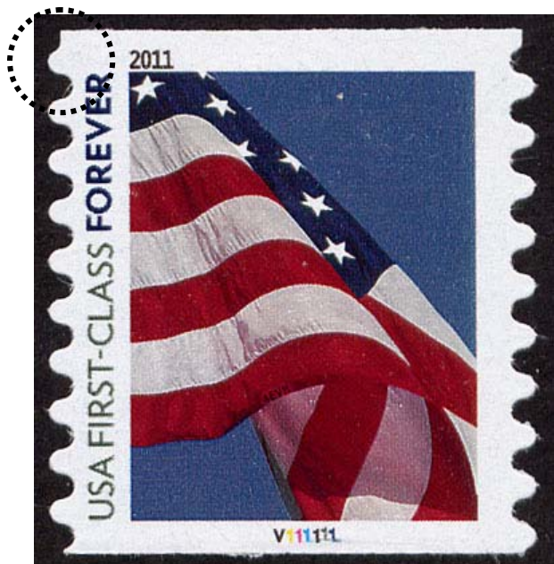
Example of the PV die cut

The Forever Liberty Head and Flag from Avery Dennison went on sale nationwide on December 1, 2010 in rolls of 100. The initial sales price was $44 for a roll of 100, but this price will change if rolls are sold after a future change in the first-ounce first-class letter rate.