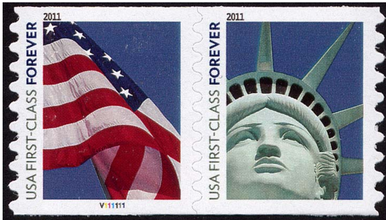
Forever Liberty Head & U. S. Flag Plate V111111 PNC ID 2010-4