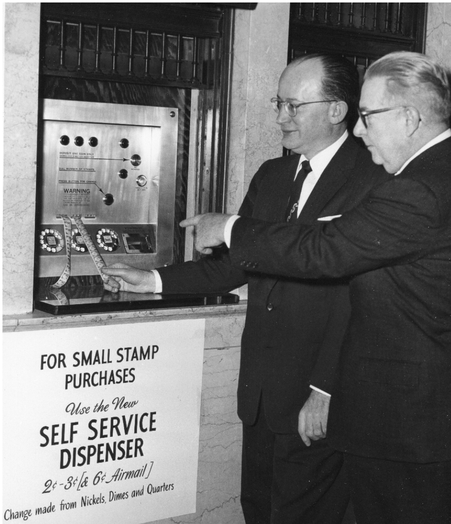
One of the first Post Office stamp vending machines, 1956

[Editor's note: The coil strip getting fingerprints is from a roll of 3¢ Liberty stamps (unless the photo can be dated to before October 1956, it is unknown if the coils were "wet printed" or "dry printed"). The dispensed coil strip to its left is of a roll of 2¢ Jefferson stamps (Scott 1055d), also part of the Liberty series. Interestingly, the "2¢" display stamp is a 2¢ John Adams coil (Scott 841) from the Presidential series of 1938.]