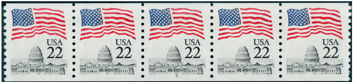
22¢ Flag plate # 5, “top of capitol missing”

I thought you might like to use the attached scan in Coil Line (shown above). It is a plate number strip of five (#5) of the 22¢ Flag over Capitol, Scott # 2115[a]. The stamps are missing the “spire” or “statue” on top of the Capitol dome. I know nothing about it or its value. I find it interesting.