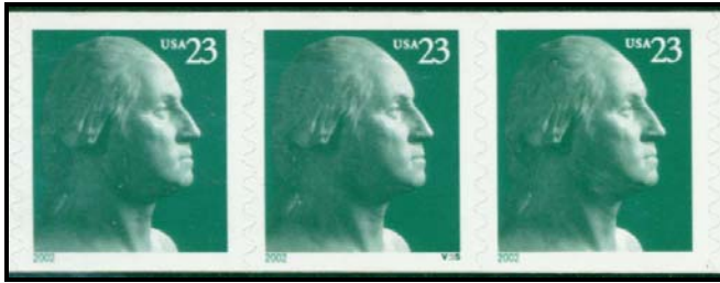
23¢ George Washington (2002) # V35, die-cut VP (stock picture)

Someone is trying to pass off pairs of the 23¢ George Washington coil with “blind” die cuts as imperf pairs. The blind die cuts (weak impressions of the die cutting that do not completely cut through the paper) are not in the proper place between the stamp designs , but instead run through the “23”. They were offered in two different auctions this past December and January. In both cases, I showed the blind die cuts to the auction houses and they withdrew the lots.