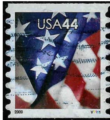
Peak/Valley to Bell Top-Right 44¢ Flag # V1111

(Left-side die cut is normal P/V pattern. Contrast right side's lower-than-normal pattern, revealing more row separator as shape of upside-down bell.)