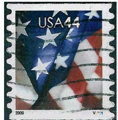
Peak/Valley to Lower Peak/Valley 44¢ Flag # V1111

(Left-side die cutting starts with peak at top corner; only the lower corner has vertical part of row separator. Contrast right side's pattern.)