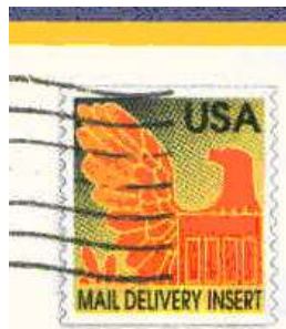
(25¢) American Eagle mimic from 2006

While waiting to share some advertising uses of coil simulations, examples from a new campaign crossed our path – twice in one week. Interestingly, the same insurance company utilized both simulations, separated by nine years. ( The newest images are on page 159. )