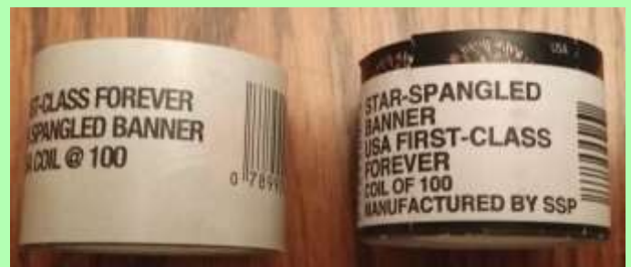
SSP's <49c> SSB coil rolls (previous, at left; recent, at right)

The worst example of an inconsistent strip I can cite has widths that vary from 13.5 to 13.9 mm. The 13.5 mm stamp is the stamp immediately to the left of the precancel gap and the 13.9 mm stamp is the stamp immediately to the right of the precancel gap. The other stamps on the strip (on both sides of the gap) are 13.8 mm. (please see page 150)