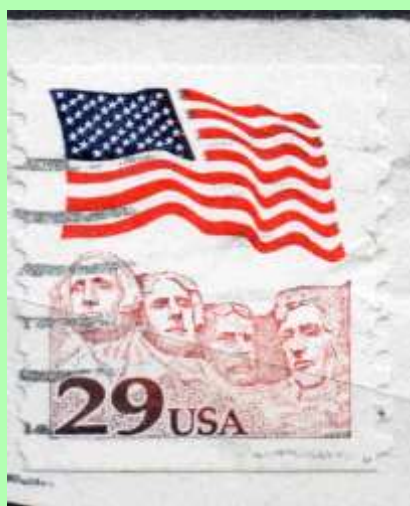
(at left) Unnumbered "Brick red" oddity of 29¢ Flag over Rushmore

(from page 156, Direct mail sightings ) down to three stamps instead of four, enclosed in mailings received on October 9. This is a new approach for this nonprofit mailer from prior mailings over the previous year (or longer, if memory serves). Interestingly, the next mailing found from this firm had a major goof ( shown above at right ). The coil stamps were affixed on top of the USPS-specified markings needed to expedite business-reply mail around the facing, canceling functions of ordinary collected mail. I wouldn't want to hazard a guess as to the exception handling these would require in the mailstream if mailed.