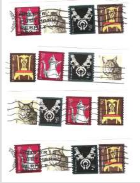
Clippings from direct-mail appeals using four low-value coils apiece (total, 10¢, the minimum franking for standard-class presort mail)