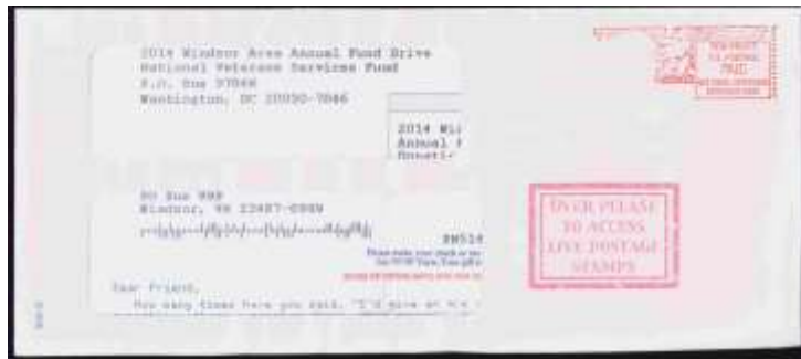
(above) July 20, 2015 appeal for “National Veterans Services Fund”; (below) Part of reply envelope