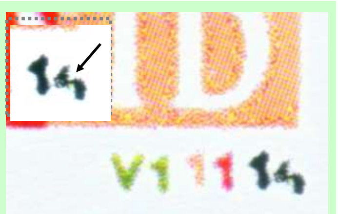
Mangled last digit in (10¢) Atlas PNC (first shown in last month's Forum)