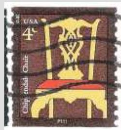
(from 3 rd row) (3¢ in 2 nd row also has a #)