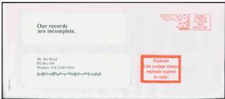
(above) June 10, 2015 mailing for “Project Cure”