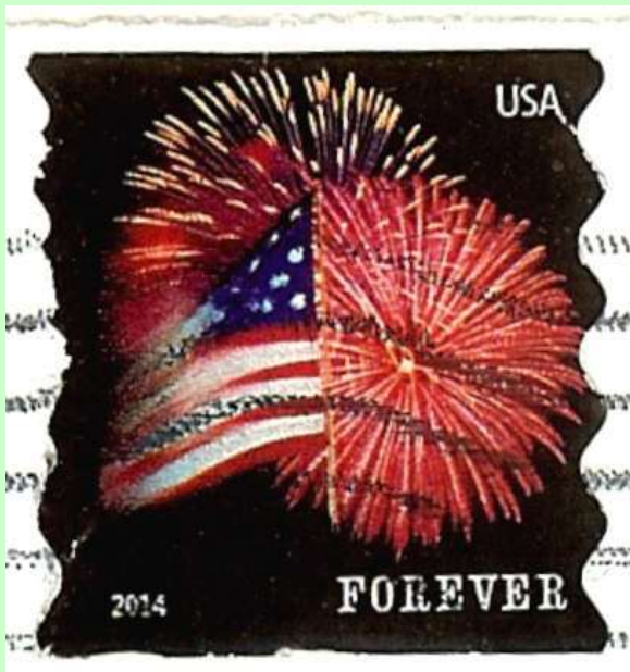
Counterfeit <49c>Star-Spangled Banner