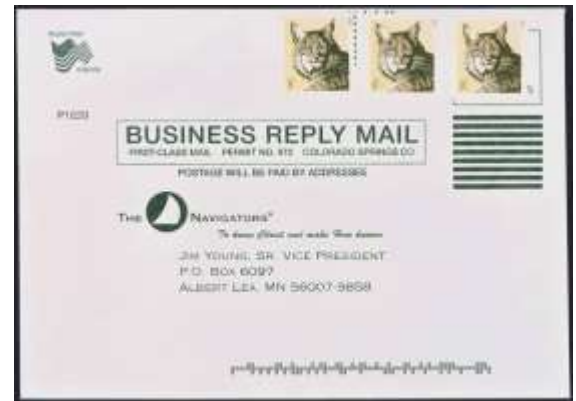
First time seen: Token postage hides facing identification mark (FIM) that facer-cancelers use to sort business reply mail.

When member Jeff Fiszbein's mixture sorting yielded the six four-coil clippings from direct-mail appeals shown in the May 2015 issue, we noted not one of the 24 coils has a plate number. Jeff has since found four more clippings ( at far left ) further in the mixture. Some of the coil sequences differ from the "1¢-2¢-3¢-4¢" and "4¢-3¢-2¢-1¢" clips of May. This time, three of the 12 coils have numbers.