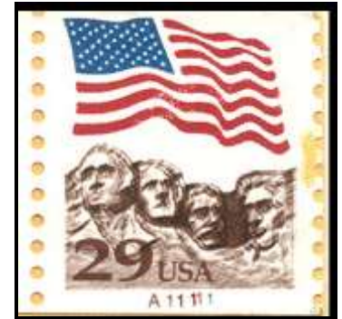
Scott 2523 (#7), Scott 2523A (#A11111)

At time of the article nearby, only the Bureau of Engraving and Printing (BEP) had made conventional perforated coils of issued U.S. postage. Regardless of perforator used, since 1914 their gauge was 9.8. Coils from private suppliers began to be issued in 1991 with the gravure 29¢ Rushmore (above, right). Some say it is gauge 10.2.