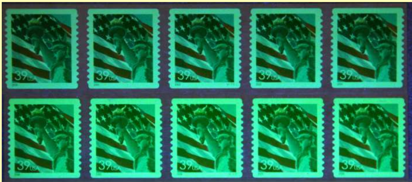
A. 39¢ Liberty & Flag #V1111 – two phosphor-tagging types among affixer rolls

Kurt Albrecht attended a recent stamp show, partly to hunt for a specific PNC variety, and filed this report: