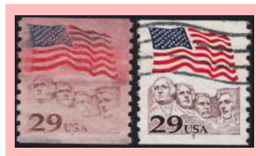
▲ Freakish cause inquiry... page 85