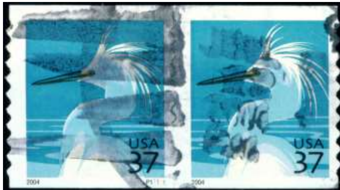
Off-paper attached used pair, 37¢ Egret P1111

[Please note that barring a "rush" print order