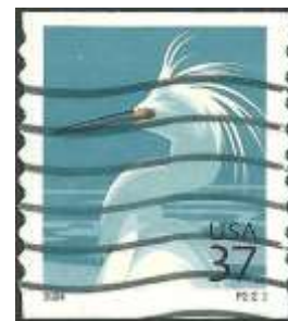
Rare PNCs V21113 and Multi-tie P22222