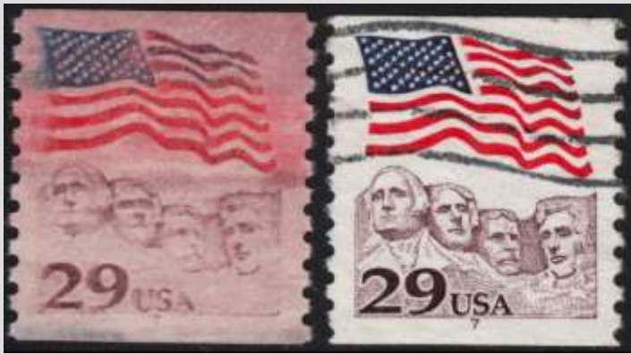
Colors-smeared used copy of 29¢ Flag over Rushmore plate #7 with normal PNC for comparison (in color on front page)

Printing anomaly, or post-purchase ruination? Member Dan Forgues found an odd used copy of the 29¢ Rushmore #7 shown above (with a normal copy at right for comparison). He's curious if anyone else has come across a similar example, or can explain what caused this effect. He noted that the Mount Rushmore design elements appear quite faded, as if barely printed and also smeared.