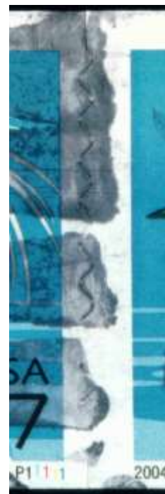
Smearly postmark ink highlights die-cut incision ties in this close-up