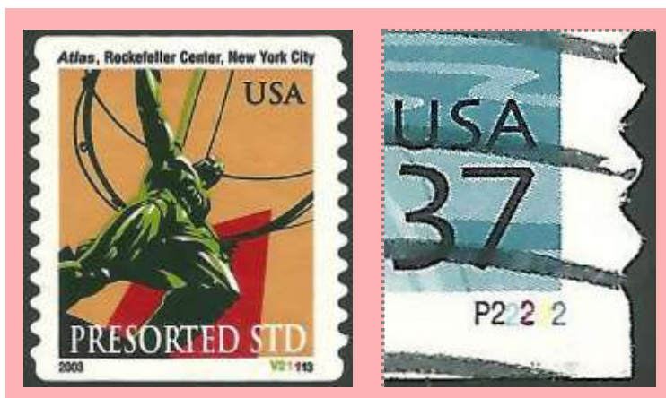
Atlas V21113, Egret P22222 make news... page 86