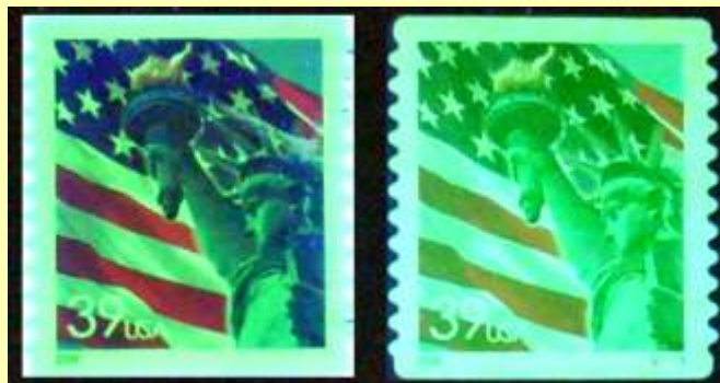
B. phosphored paper ( Scott 3980a )