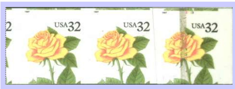
▲ Where is the plate number?... page 83