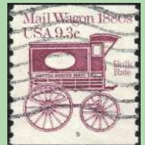
Auction lot 341... page 39 ▶