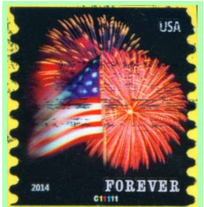
<49¢>SSB embedded "inverted bell" found. (As this stamp's row and row above it were die-cut "valley-peak," the bell at upper-left is inverted.)

At position 8L (eighth stamp to the left of the