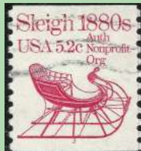
◀ Auction lot 336... page 39