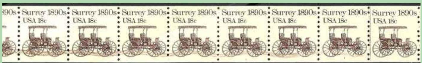
(from page 29, Readers' Forum) Part of mint strip, 18c Surrey plate #1 (with long, wavy "ink wisp" starting heavy at left and waning to right)

In this bottom example, the magenta and black inks again appear shifted in relation to the other colors, but in different directions. Now, the red stripes are only tinged with yellow at top, but the flagpole's yellow extends to its left and the star burst shows much more yellow streamers.