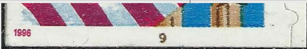
detail of Lot 3 (see also front cover)