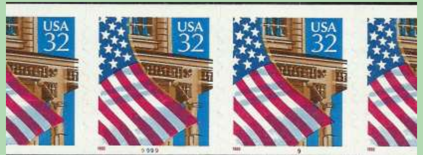
▲ detail of Auction lot 248... page 36