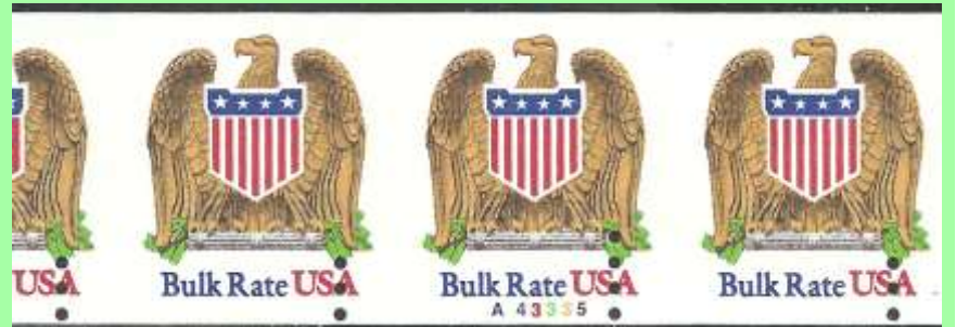
▲ detail of Auction lot 280... page 37

Looks like one shown in August Issue, yet... page 29