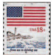
Lot # 384