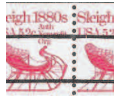
Lot # 297