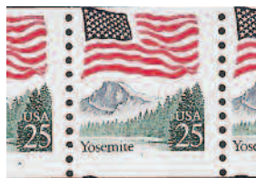
Lot # 296