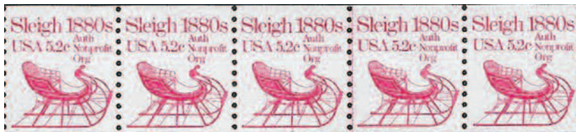
Lot # 20

The PNC 3 Spring Auction listings begin on Page 26