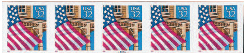
Lot # 115