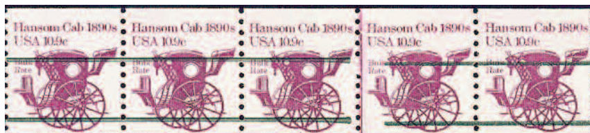
Scott #1904a (issued March 26, 1982) plate # 1

Mailed from Zip Code 87185 on or near March 31, 2017.