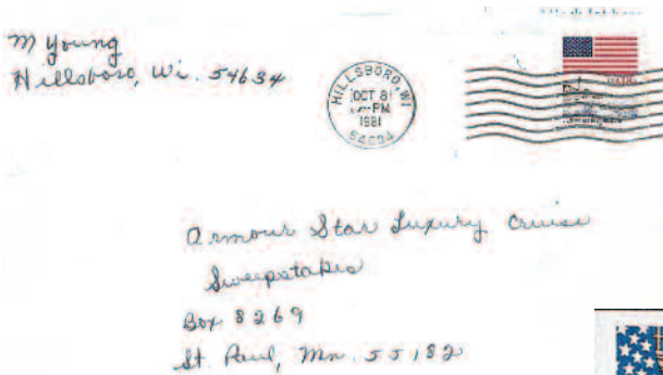
Lot # 349