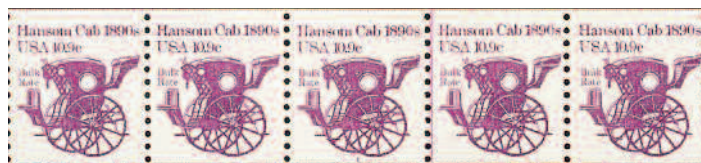
10.9¢ Hansom Cab mint plate strip of 5, plate # 1 (Scott # 1904)

This is the phosphor-tagged "collector" edition of the 10.9¢ Hansom Cab shown on the masthead page, issued together with the untagged precanceled version 35 years ago on March 26, 1982. The masthead shows the workhorse version, precanceled with two lines in black ink.