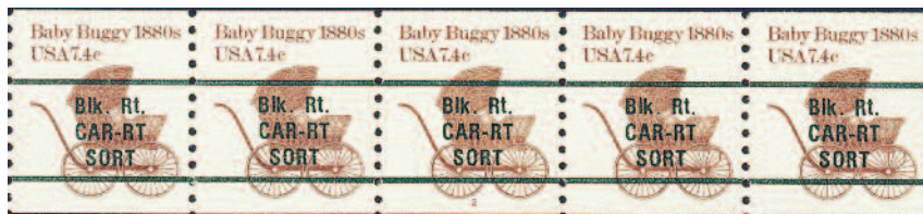
Scott #1902a (issued April 7, 1984,) plate #2

Mailed from Zip Code 87185 on or near March 20, 2019.