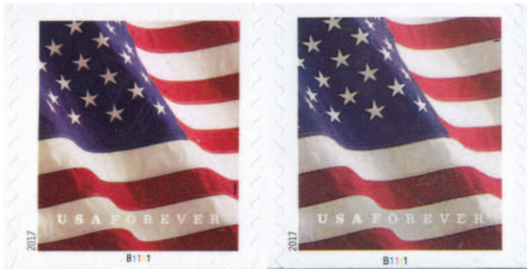
Figure 3 - The fake stamp is on the right

I will report on the other counterfeits I have found in a later article.