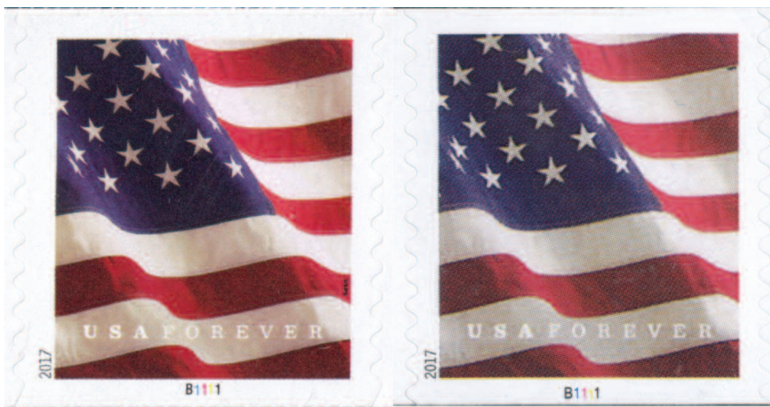
First Mint Roll of Counterfeit Stamps Found with a Plate Number See Page 48