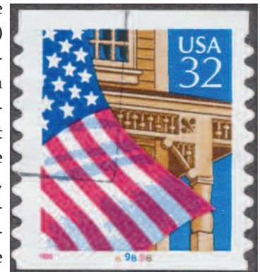
Figure 2: PP/VV variety of 2915A

Peaks are the portions of a die cut that protrude from the side of the stamp while valleys are the portions that make up the inward curve. The shapes present at the top left and bottom left corners of a vertically die-cut stamp, such as a FOP, are indicated with the abbreviations P/V (or PV) and V/P (or VP), respectively. The abbreviation PV/VP indicates a peak/valley configuration on the left side of the stamp (peak at the top, valley at the bottom), and a valley/peak configuration on the right side (valley at the top, peak at the bottom). Figure 1 is an example of PV/VP and VP/PV varieties.