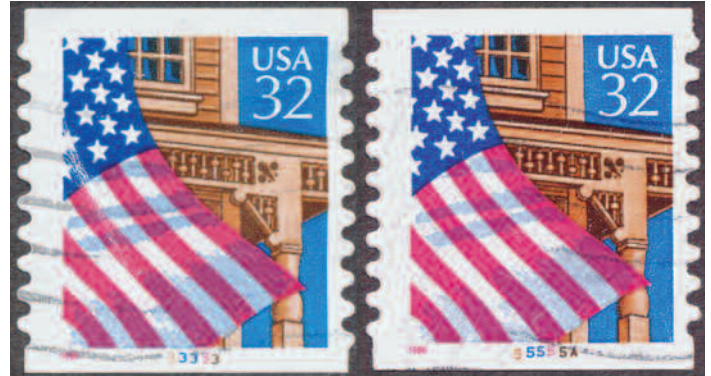
Figure 1: PV/VP and VP/PV varieties of 2915A

It was with the die-cut varieties, like those in the eBay listings, where things got interesting, at least to me, as this is when the peak and valley varieties came into play.