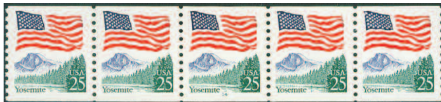
Scott #2280a (issued February 2, 1989, ) plate # 14

Mailed from Zip Code 87185 on or near July 20, 2019.