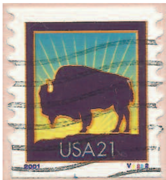
Figure 4 - not a table top