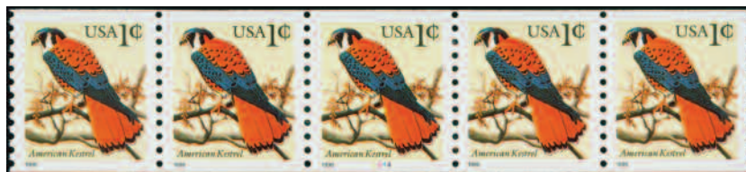
Scott 3044a (discovered around 20 years ago ) plate # 4444

Mailed from Zip Code 87185 on or near June 20, 2019.