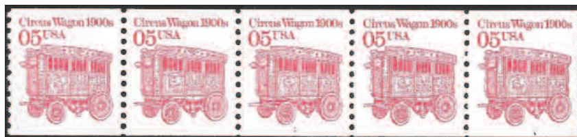
Scott #2452 (issued August 31, 1990) plate # 1

Mailed from Zip Code 87185 on or near July 20, 2020..