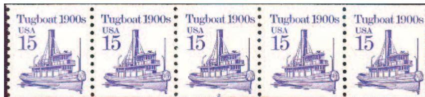
Scott 2260a (overall-tag found July 1990) plate # 2

Mailed from Zip Code 87185 on or near June 20, 2020.