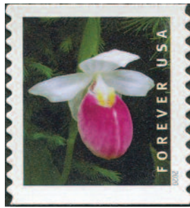
8 Pink and White Lady's Slipper