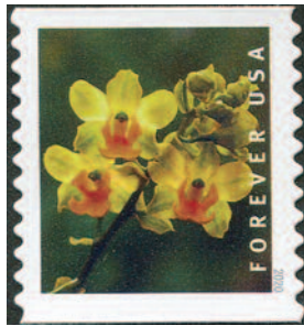
2 Terrestrial Cowhorn Orchid