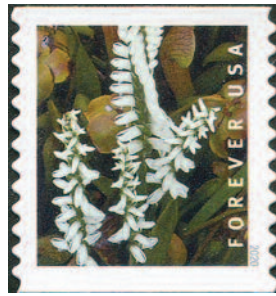
4 Fragrant Lady's Tresses