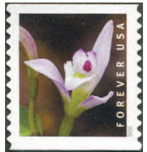
10 Three Birds