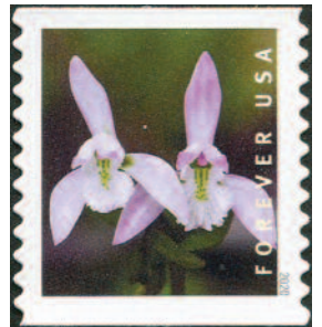
1 Three Birds