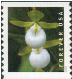
6 California Lady's Slipper