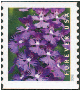
1 Greater Purple Fringed Orchid