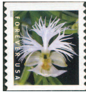
9 Eastern Prairie Fringed Orchid