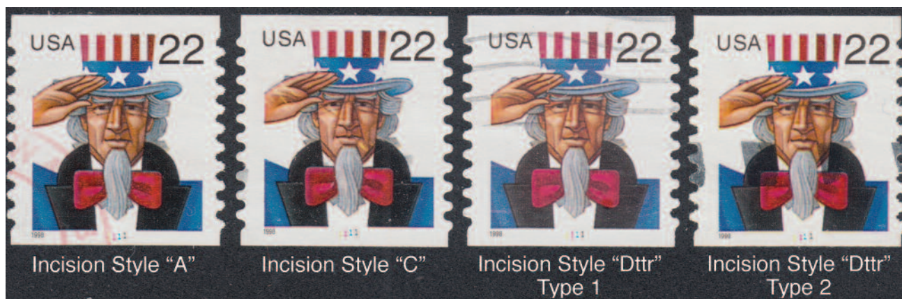
A Salute to Die Cut Styles See Page 59