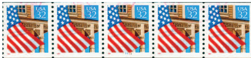
Scott 2913 (issued May 19, 1995) plate # 11111

Mailed from Zip Code 87185 on or near April 20, 2020.