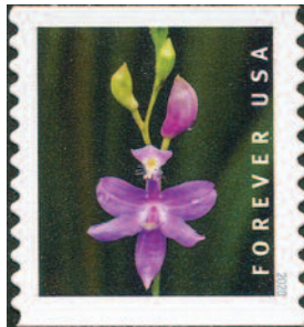
3 Common Grass Pink