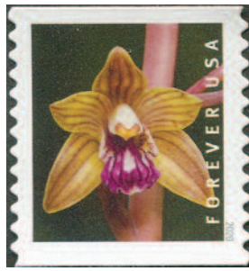
7 Crested Coralroot